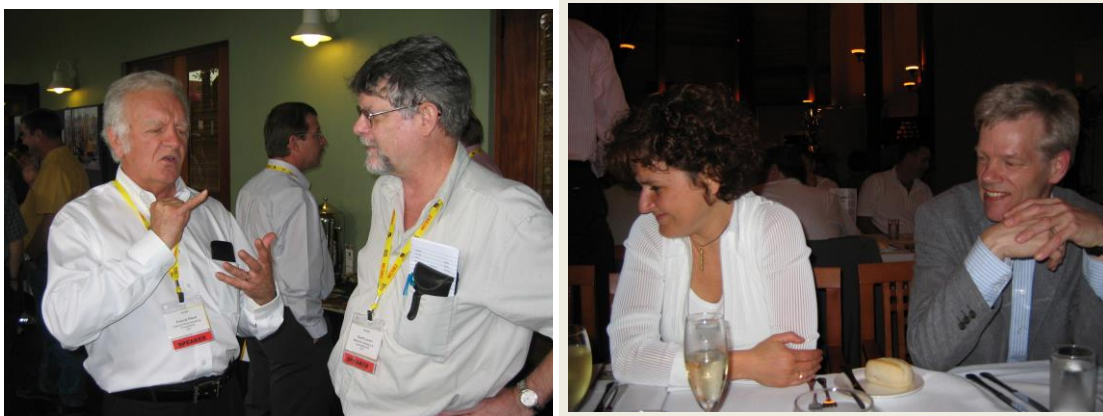
Figure 2 Social snapshots from WCSB2.

Socially, a great time was had by all at WCSB2.