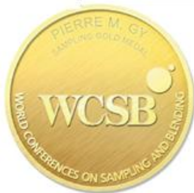
Figure 3 Pierre Gy Sampling Gold Medal